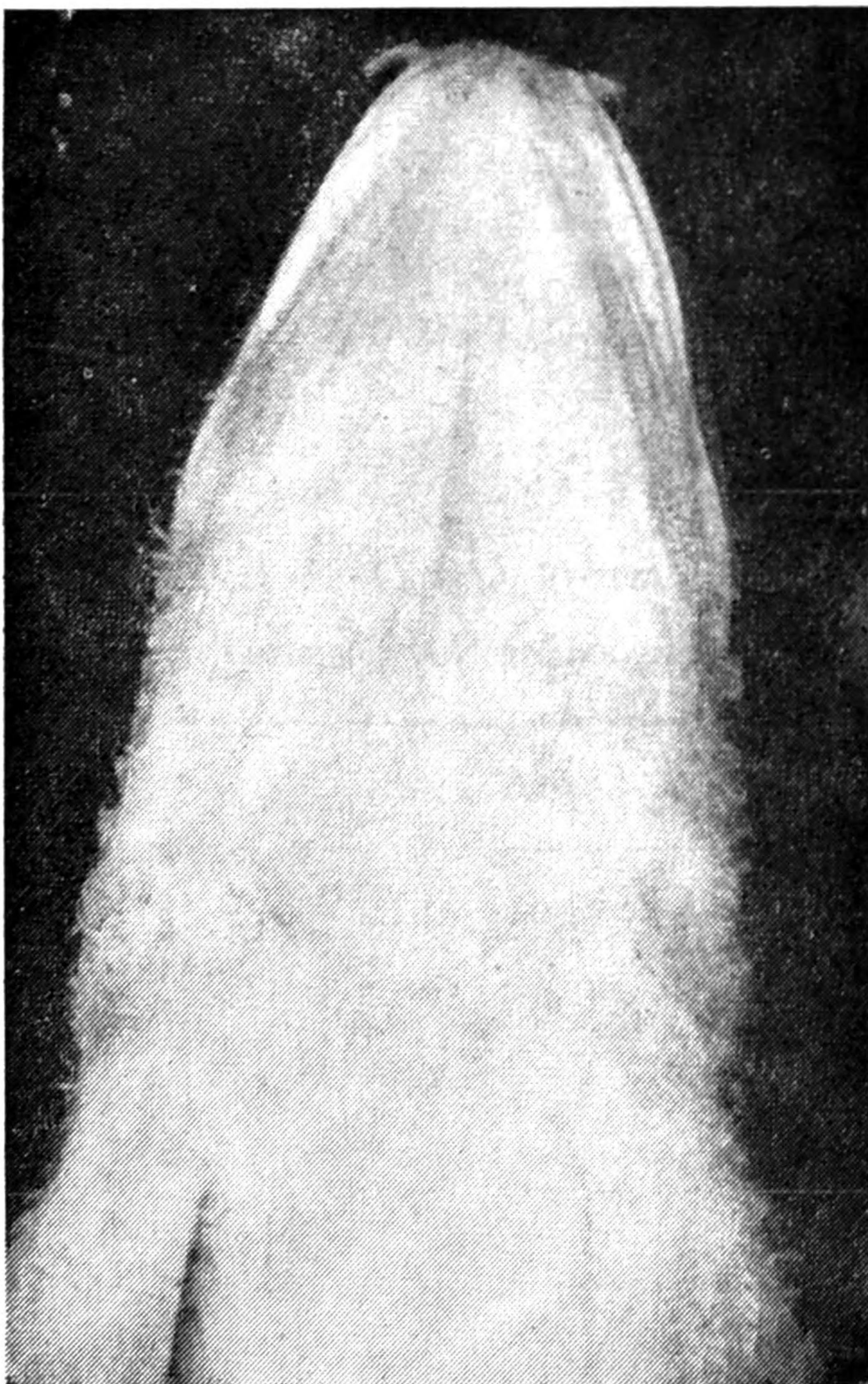
Fig. 2. Ventral view of the head of Polyp-terus with heavy infection of Macrogyrodactylus . The scales are not clearly defined.