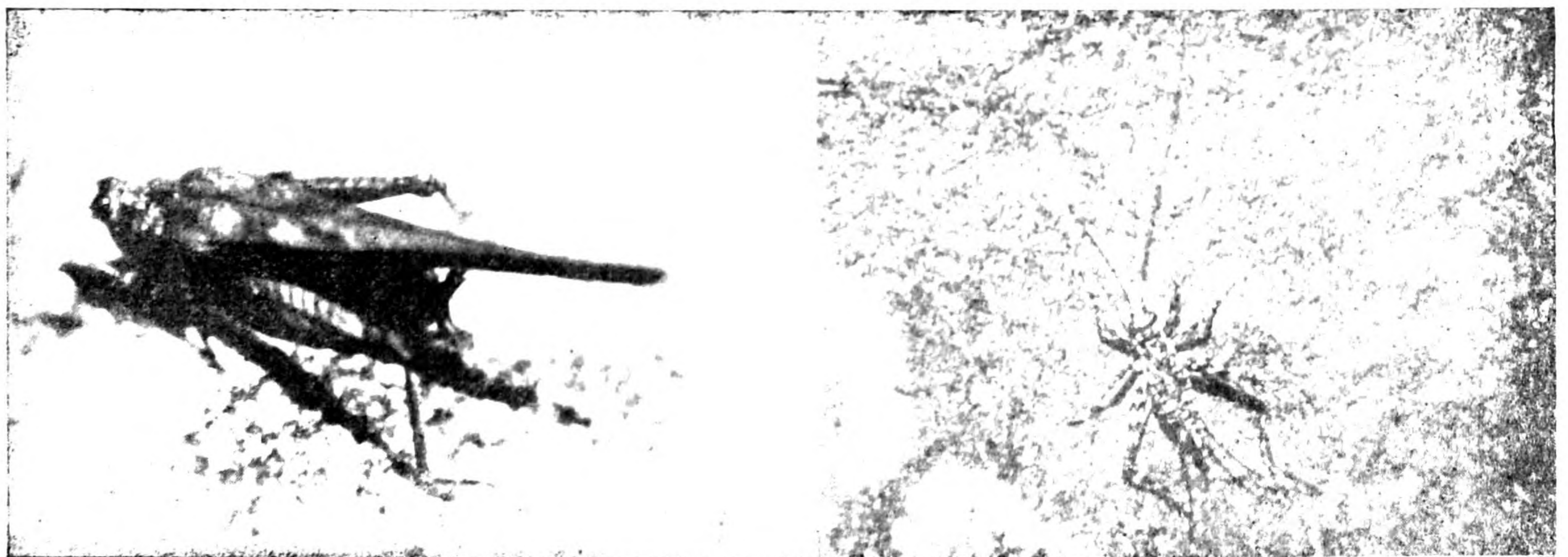
Fig. 6. Euscelimena gavialis (Sauss.) ♀.

Widely distributed in Ceylon. CHOPARD (1936) reports on very scarcely occurring macropterous specimens, which were found with the typical wing-less form.